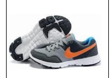
All other footwear is unacceptable.